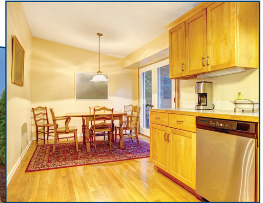
This is what that area currently looks like from the inside.